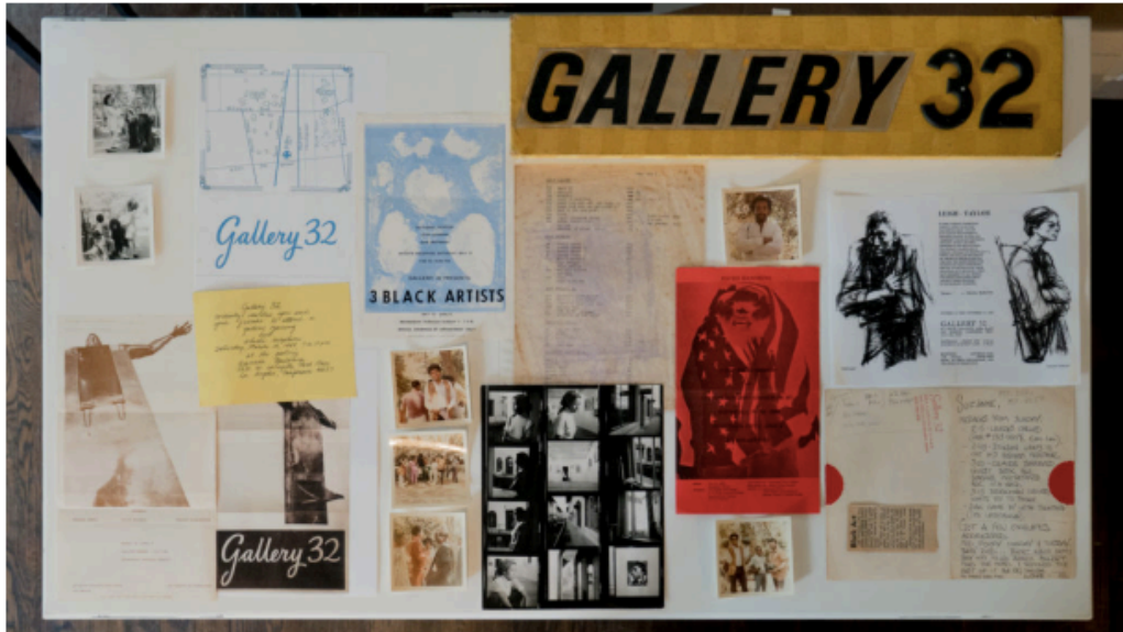
Ephemera from Gallery 32, courtesy of the artist and O-Town House.

Because I had to pay for it out of my pocket. No one was financing me. And I don't like the way they were saying Gallery 32 folded. It didn't fold. I actually closed it. John Outterbridge and I had been talking about spaces where art is shown and asking, is a white box the kind of space where art should be?