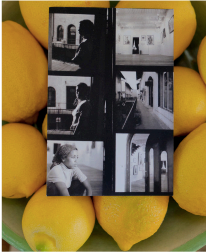
Ephemera from Gallery 32, courtesy of the artist and O-Town House.

It sounds like you created a network pretty quickly after moving to Los Angeles.