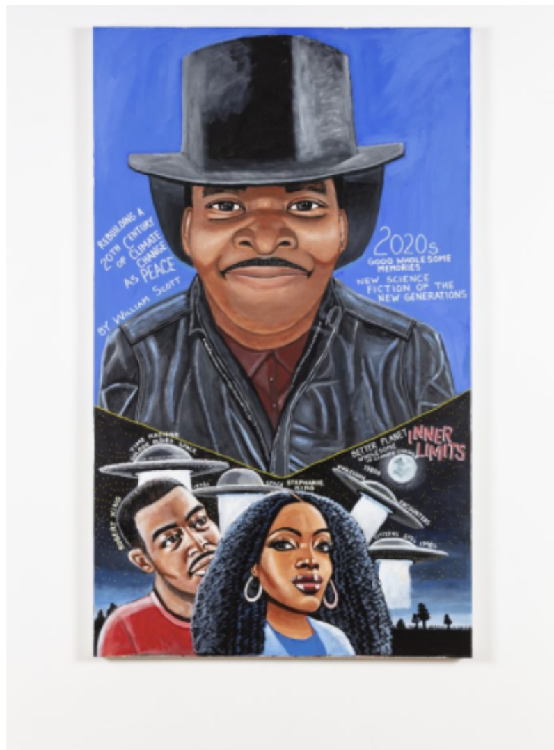
William Scott, Untitled (2019).