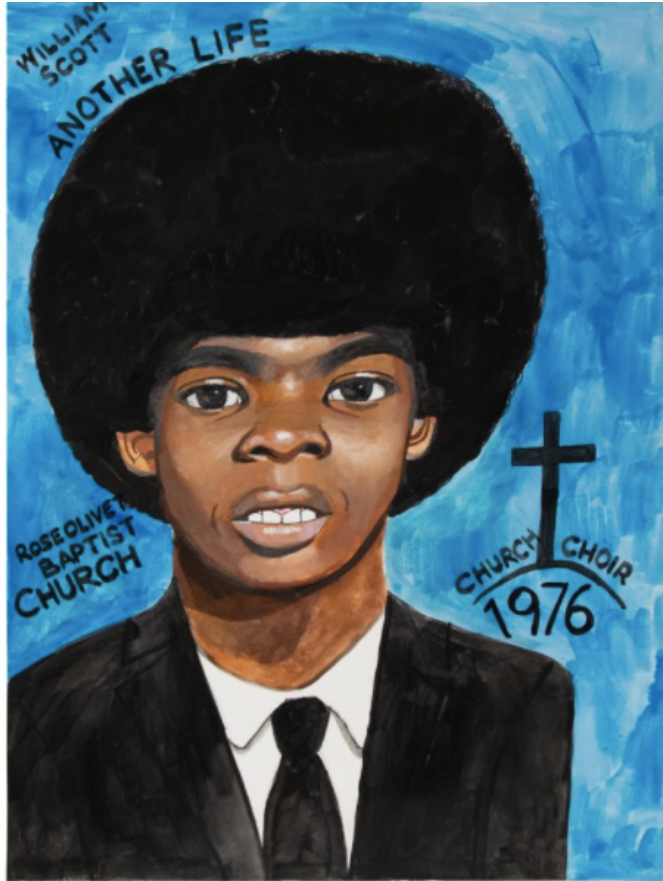
William Scott, Untitled (2020).