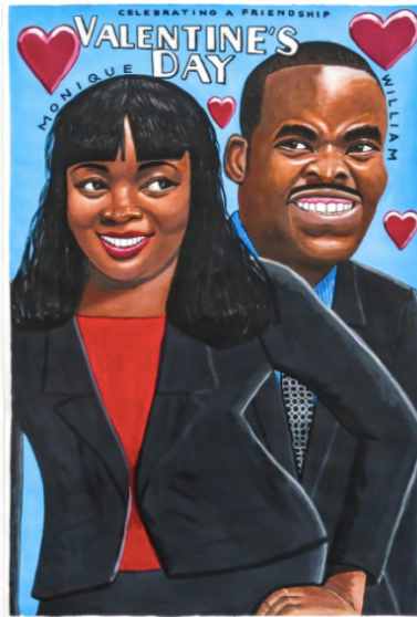
William Scott, Untitled (2015).