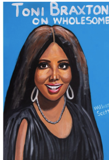
William Scott, Untitled (2013).

As galleries and art institutions around the world begin to reopen, we are spotlighting individual shows—online and IRL—that are worth your attention.