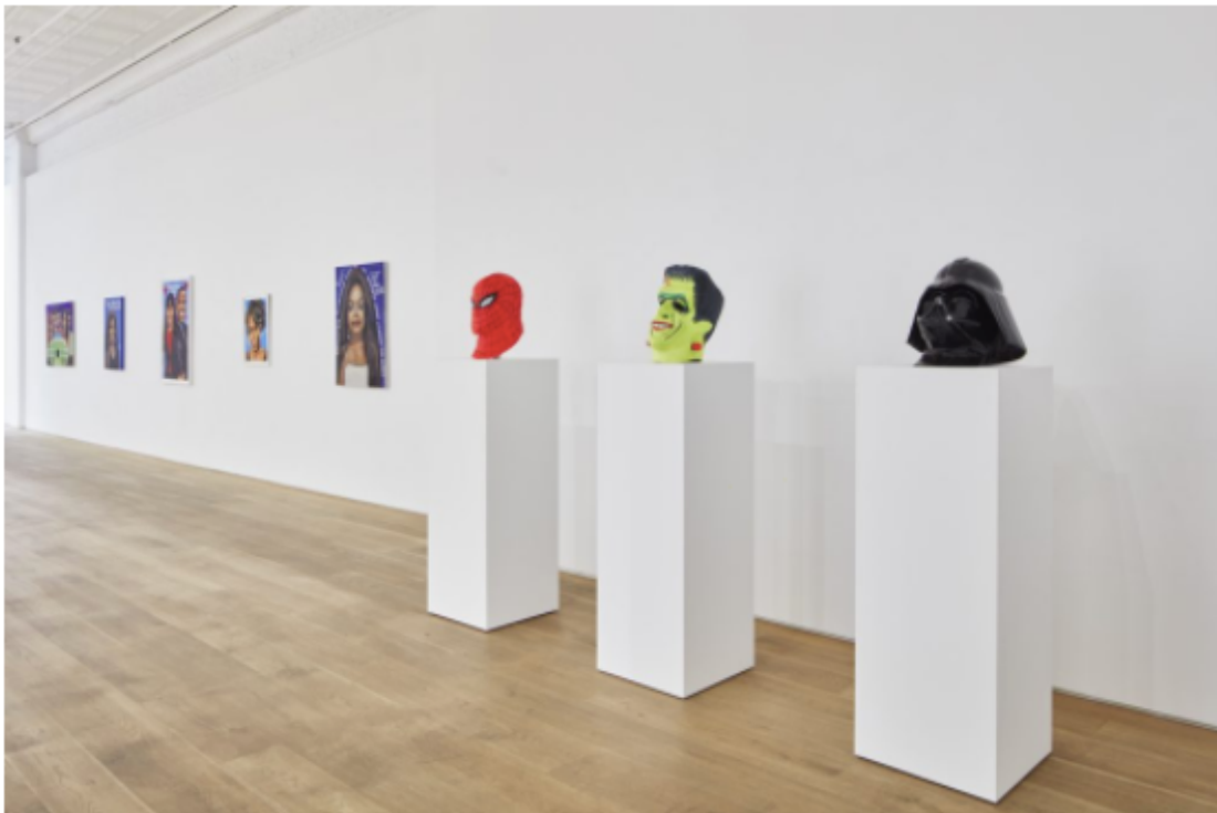
Installation view, "William Scott: It's A Beautiful Day Outside."