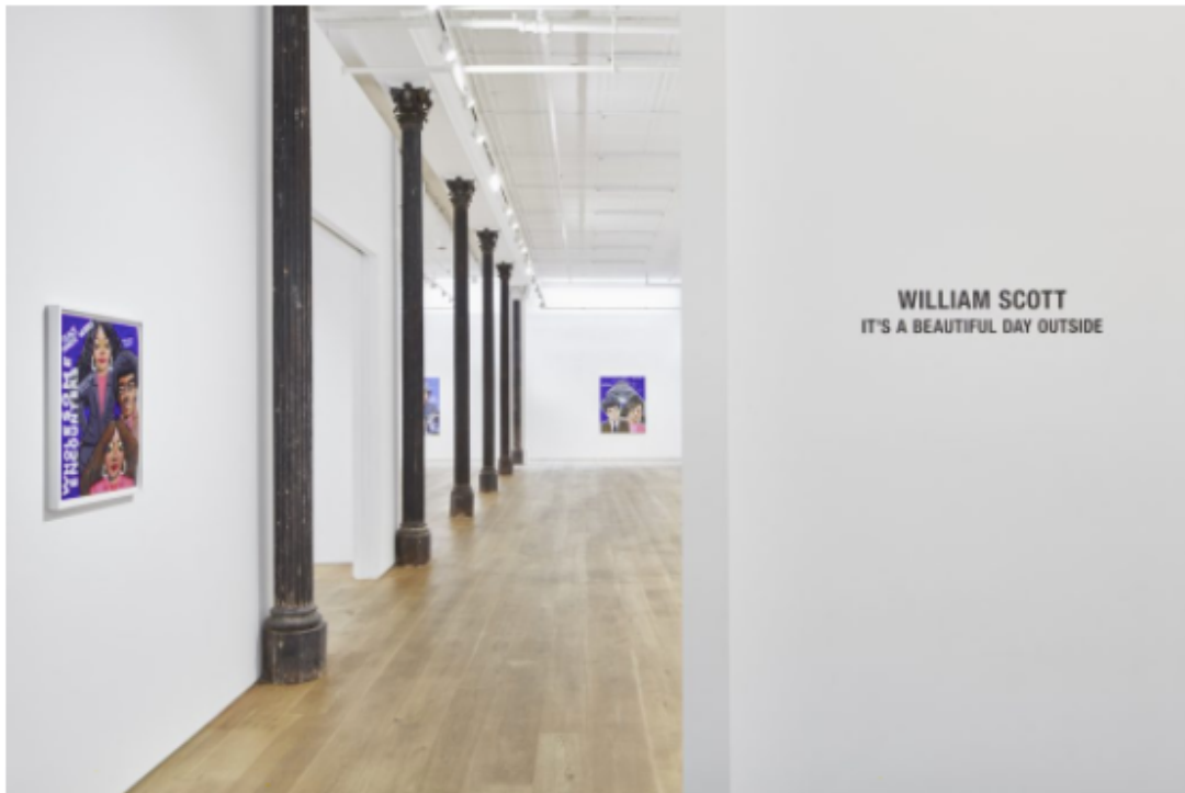
Installation view of "William Scott: It's A Beautiful Day Outside."