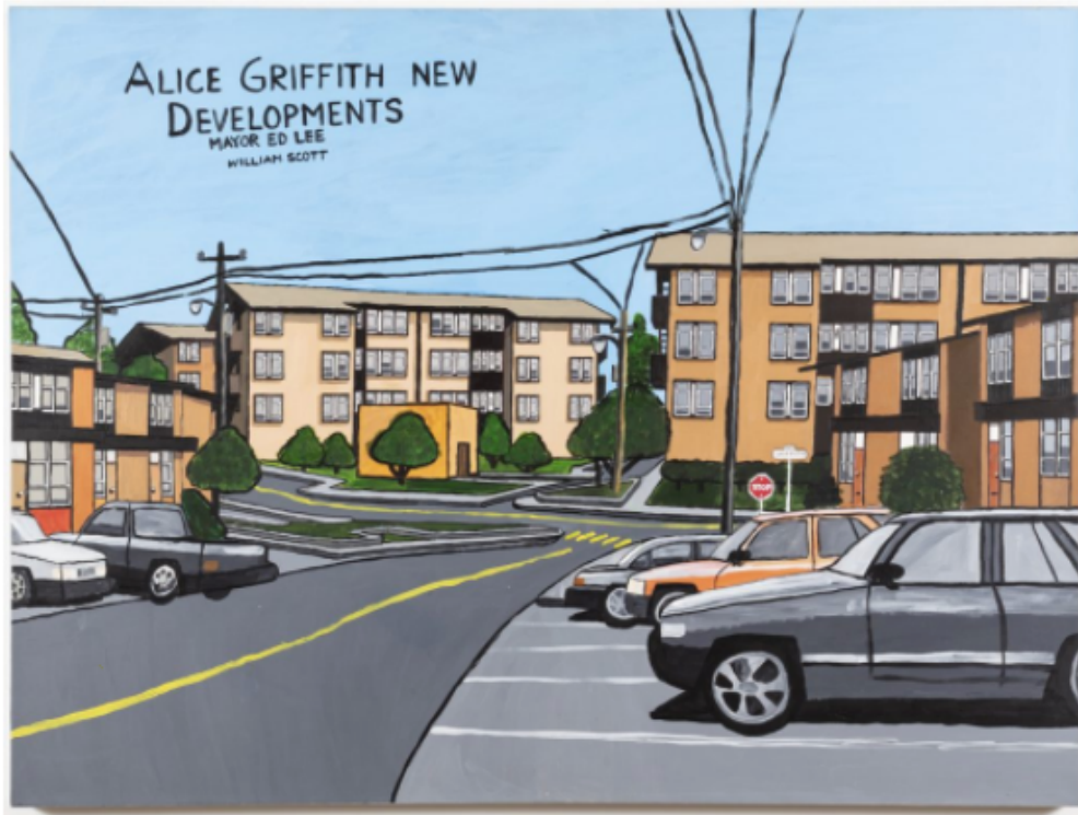
William Scott, Untitled (2013).