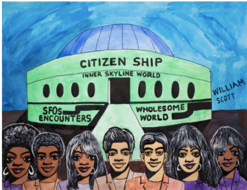
William Scott, Untitled (2015).