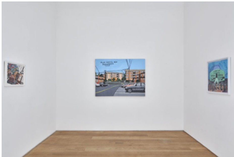
Installation view, "William Scott: It's A Beautiful Day Outside."