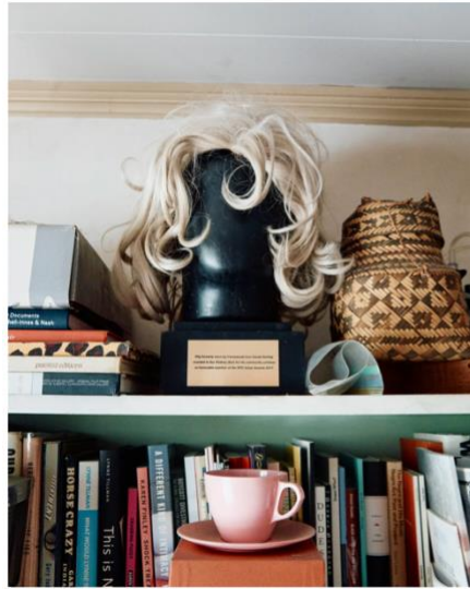
In a guest bedroom on the second floor, a wig worn by the actress and Warhol superstar Candy Darling.